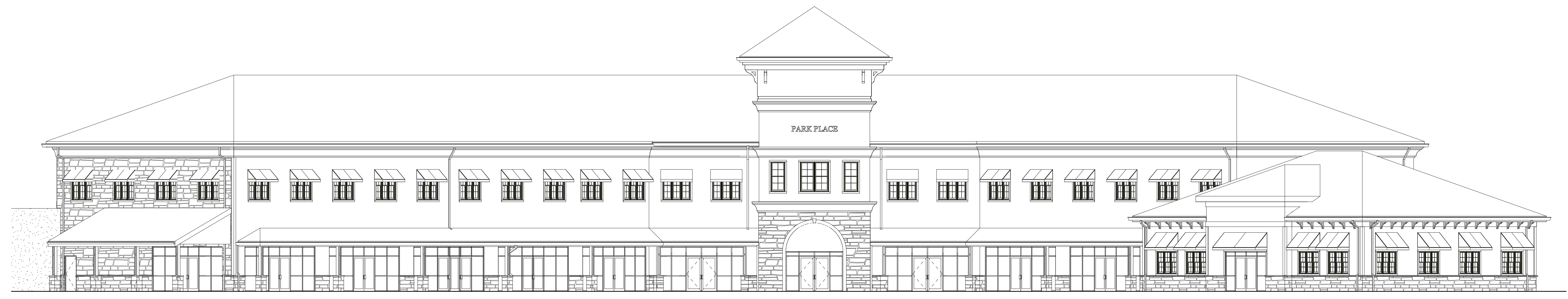
MAIN ELEVATION SCALE 1" = 10'-0"