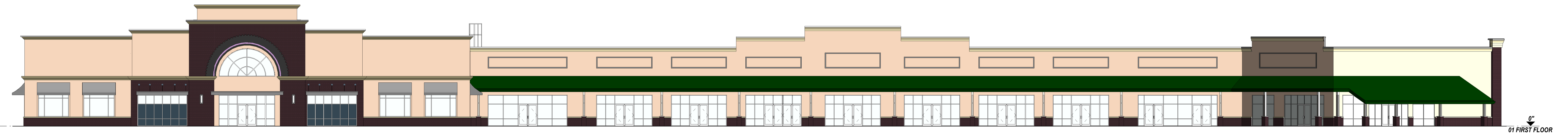
MAIN ELEVATION SCALE: 1/16" = 1'-0" SHEET T-1.1